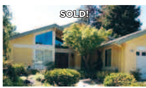
3044 Shetland Drive • Represented Buyer Sold for $880,000!