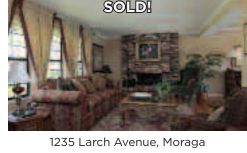
Sold for $1,450,000!