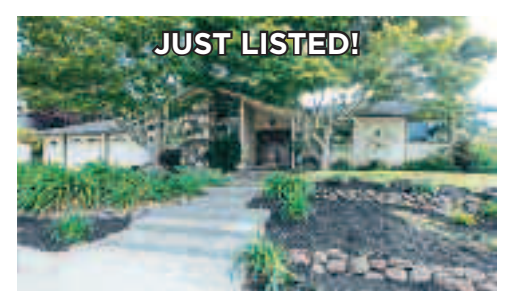
1223 Larch Avenue, Moroga Offered at $1,250,000!